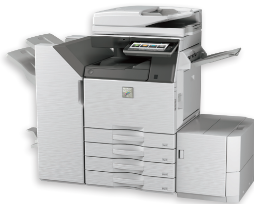
MX-3570N color Advanced Series document system shown with options.