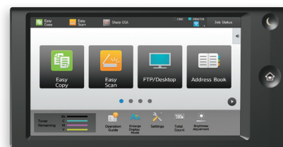
Sharp's customizable touchscreen display offers a user-friendly graphical interface.